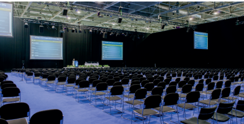
HUNGEXPO BUDAPEST UP TO 15.000 PEOPLE