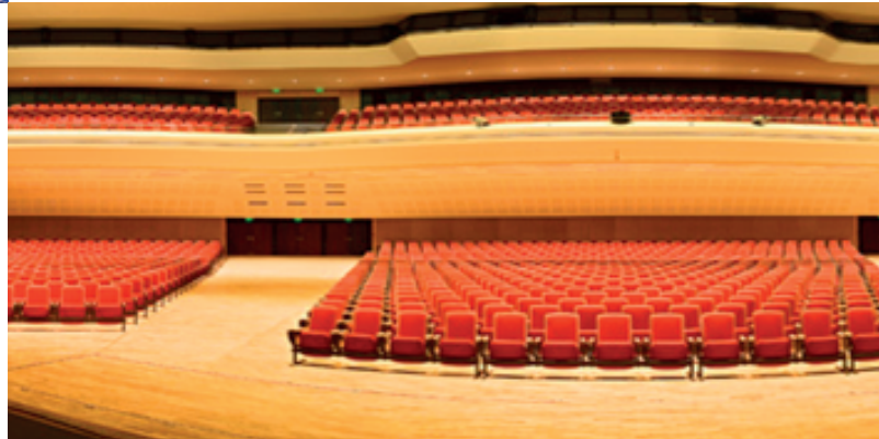
BUDAPEST CONGRESS CENTER UP TO 2.000 PEOPLE