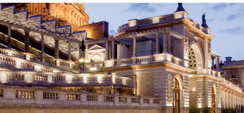
Castle Garden Multifunctional event hall UP TO 800 PEOPLE