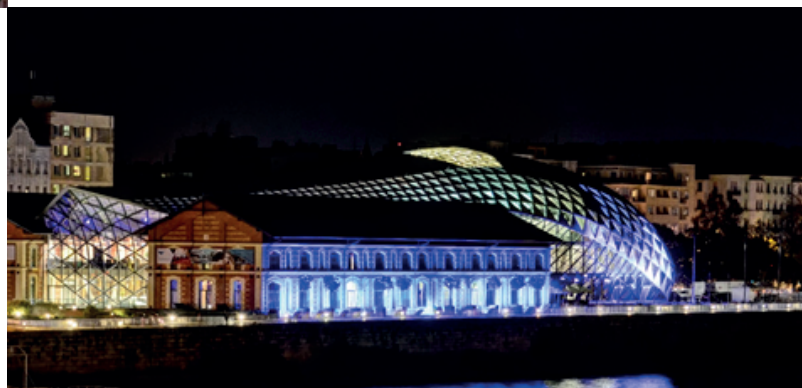
BÁLNA BUDAPEST UP TO 1.000 PEOPLE